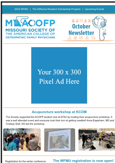
Large ad - top of newsletter

The newsletter is sent on the first of the month to more than 500 family physicians, students and residents. The open rate averages 33.5%. That creates a huge opportunity for you to increase your brand's awareness and reach!